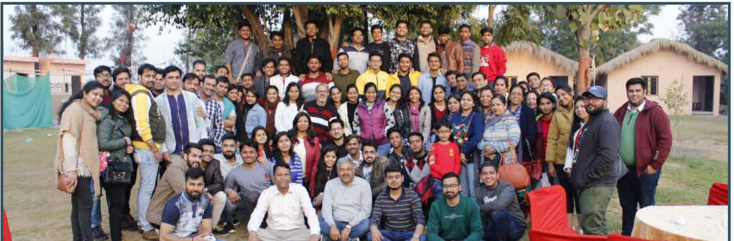
Office Picnic at Blowsom Farms on 19th January 2019